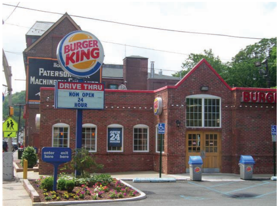
Burger King Restaurant

The Business Improvement Grant Program is available for all commercial and mixed commercial use properties with the Paterson UEZ boundaries, excluding Main Street. Business and property owners are eligible for a 50% matching grant up to $40,000 per business. Qualified improvements include minor improvements of lower and upper facades; rehabilitation of historic details; signage; awnings; lighting; security gates, fencing and landscaping. All restoration, rehabilitation and new construction projects must conform to the UEZ Façade Improvement Guidelines as well as the Department of Interior Standards of Rehabilitation.